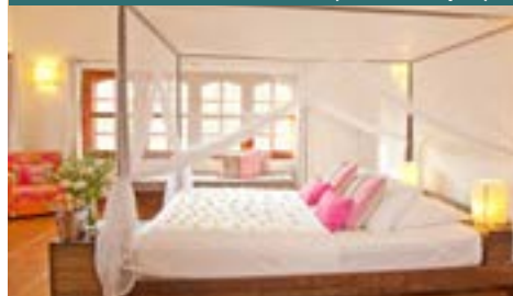
SUPERIOR DOUBLE ROOM (20 - 30 sqm*)