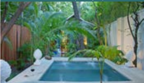
JACUZZI BUNGALOW (25 sqm*)