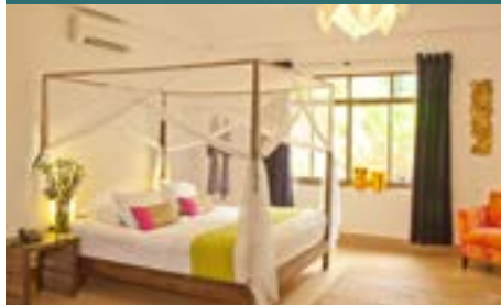
STUDIO (23 - 55 sqm*)