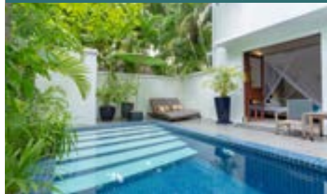
PRIVATE POOL ROOM (20 sqm*)