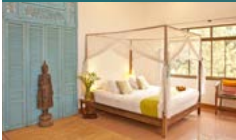
SUITE (45 - 90 sqm*)