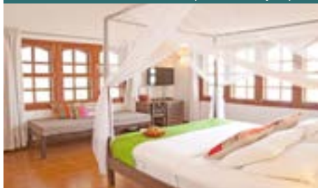
DELUXE DOUBLE ROOM (28 - 32 sqm*)